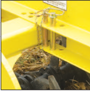
Quick Adjust Swing Arms