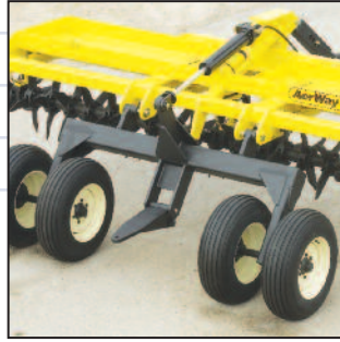
Optional Pull Type Wheel Kit