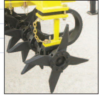
C-Flex with Outboard Star Design