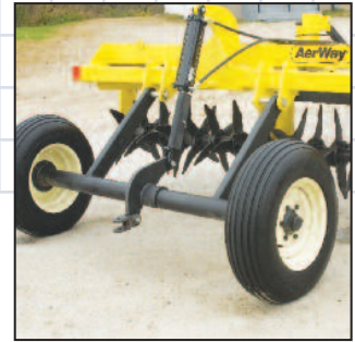
Optional Pull Type Wheel Kit