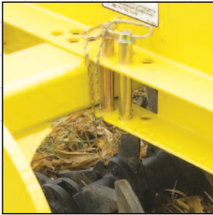
Quick Adjust Swing Arms