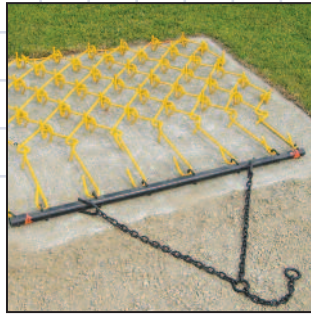
5/8" Diameter Chain Harrow