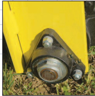
Heavy Duty Bearings