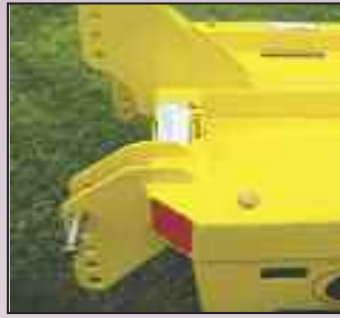
Category 0 and 1 Front Mount Three-point Hitch