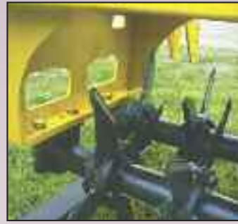
Tandem Roller Configuration