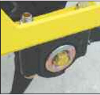
Maintenance-free 50mm (2") Pillow Block Bearing